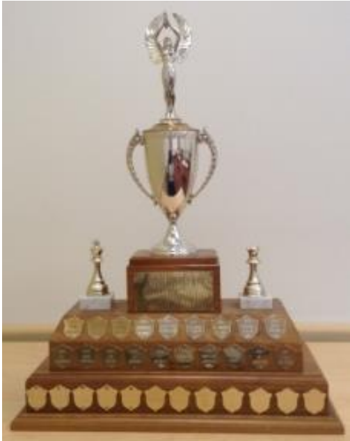
Ed Percy Trophy