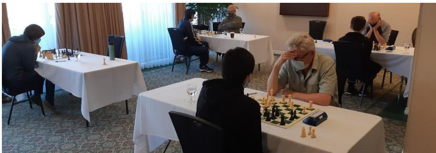
Round four, Galiano Room, Hotel Grand Pacific

1.e4 e5 2.Nf3 Nc6 3.c3 Nf6 4.d4 Nxe4 5.d5 Nb8 6.Qe2 Nf6 7.Qxe5+ Qe7 8.Bc4 Qxe5+ 9.Nxe5 d6 10.Nf3 Be7 11.Na3 a6 12.Bf4 0–0 13.h3 Nbd7 14.0–0–0 Re8 15.Rhe1 Nf8 16.Bg5 Bd7 17.Bb3 h6 18.Be3 Ng6 19.Nc4 a5 20.Bc2 Bf8 21.Bxg6 fxe6 22.Bf4 Rxe1 23.Nxe1 g5 24.Bh2 Bb5 25.Ne3 Re8 26.N1c2 Ne4 27.Bg1 Be7 28.f3 Ng3 29.c4 Bd7 30.Nd4 Bf6 31.Nec2 Ne2+ 32.Nxe2 Rxe2 ½–½