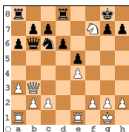
Mate in 3 for white!

Miscellaneous: Any volunteers who can help with set up: please arrive at 1pm. Ask not what your tournament director can do for you. Ask what you can do for your tournament director!