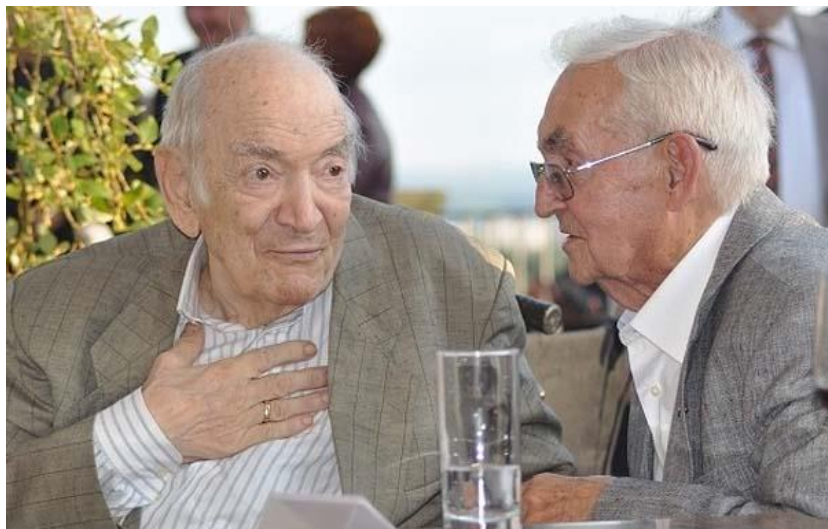
Victor Korchnoi and Mark Taimanov, Dresden 2014

VIKTOR LVOVICH KORCHNOI (23 March 1931 – 6 June 2016)