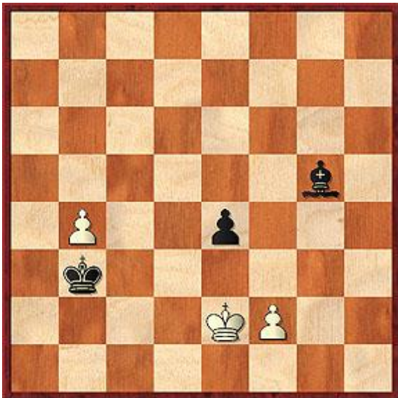
The losing moment