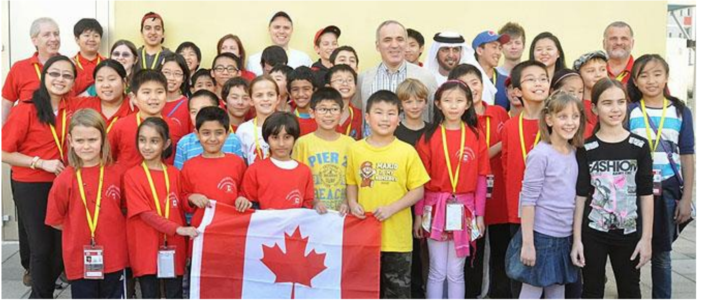
Most of team Canada, along with some guy named Kasparov who happened to be passing by