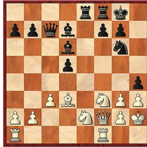
Black to play