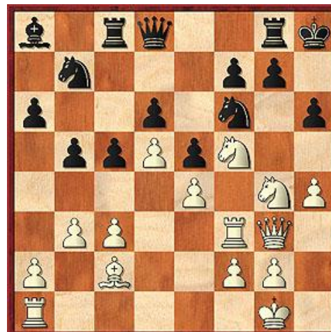
White to play