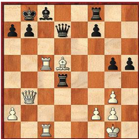
White to play