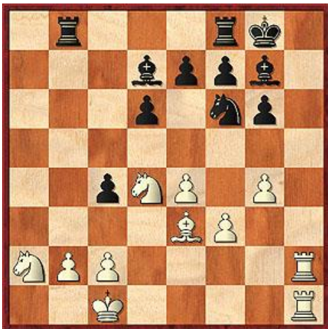
Black to play