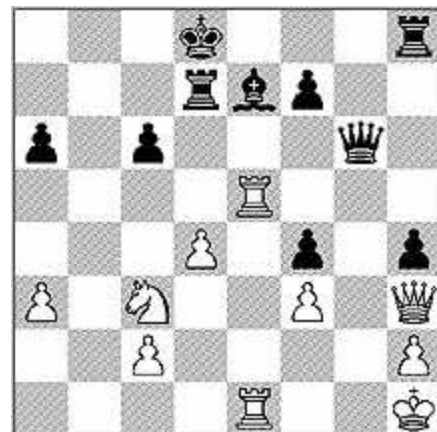
6. White to play