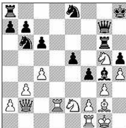
5. White to play