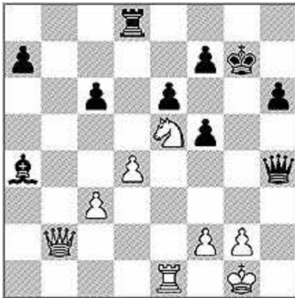
1. White to play

The following positions are all from games played in the 2008 Paul Keres Memorial