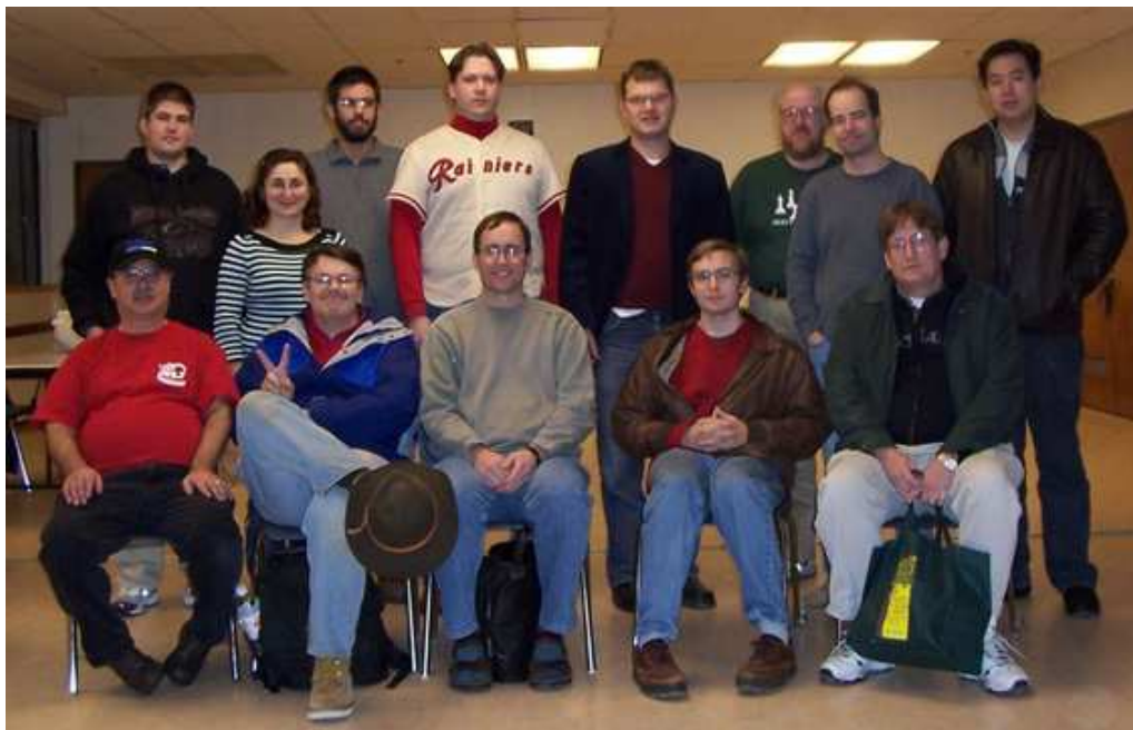
The victorious Washington contingent